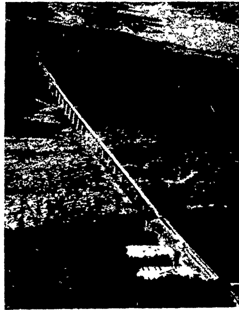
Norman Wood Bridge