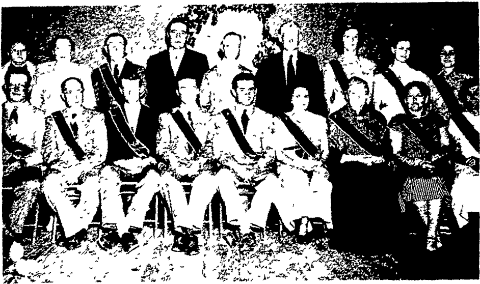
75th Anniversary Officers