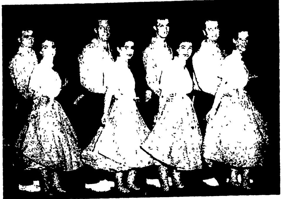
1960 Grange Square Dance Team

"It behooves each and every one of us to accept the challenge of the past and make this Grange and example for all who come after us."