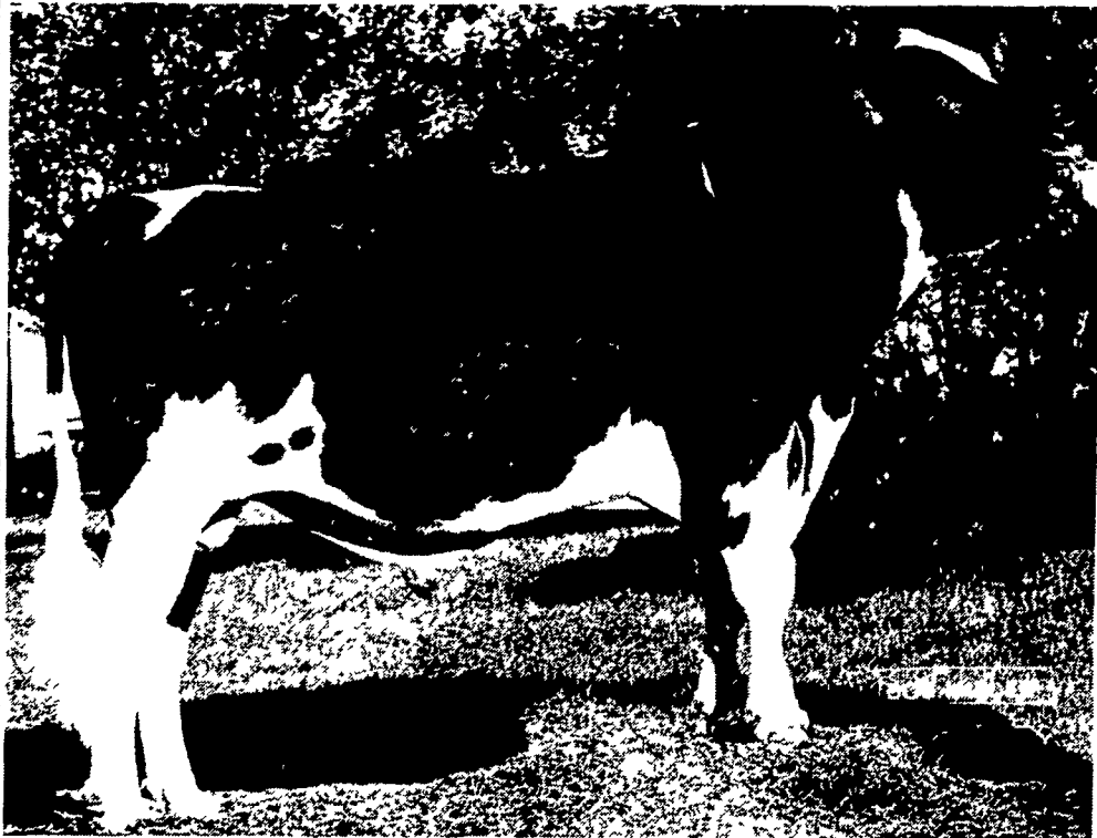
1964 Dorloy Delilah DUKE