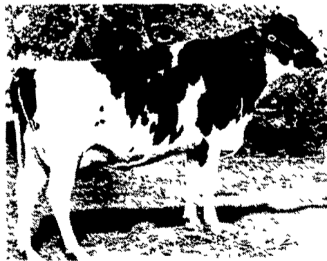
Nor-Lene Alstar Ethel - Dtr of 1928 PILOT 2y 2m 365d 2x 25,546M 4 4% 1113BF