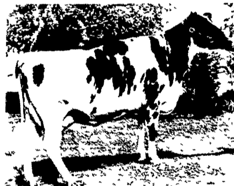
Nor-Lene Heilo Alstar - Dtr of 1928 PILOT -- 2y 4m 363d 2x 23 259M 4 8% 1111BF 3y 5m 305d 2x 20 585M 5 2% 1067BF