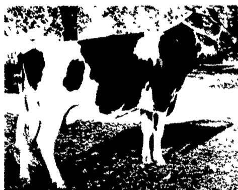
Nor-Lene Alstar Flossie - Dtr of 1928 PILOT - 2y 3m 365d 2x 23,340M 3 6% 842BF