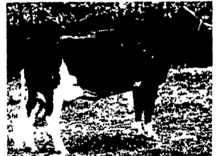
Sinking Springs Opti Theta-GP 3-8y 365d-2X 25,500M 1,003F Owner: Sinking Springs Farm, York, Pa.

15H100 Mookown OPTIMIST Very Good & Production Qualified An Optimist Daughter