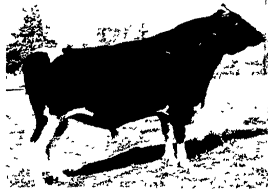
USDA Proved Sire (Jan 74) 1,041 Daus. 530 Herds Ave 15,093M 3 59% 542F Pred Dif (98% rpt) +443 +2 ($20 per lactation above breed ave herdmates)

Production and Type Improvers in Daily Service at Regular Fee