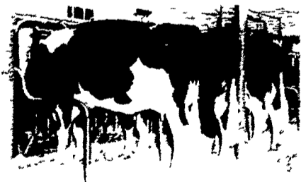
Daughters of 1924 Sizzler

Sizzler's Dam is a VG86 daughter of Sevens Burke Skylark with a Cow Index of +723 His sire is Ivanhoe Sizzler daughters stand on sound feet and legs and are high producing, good testing cows.