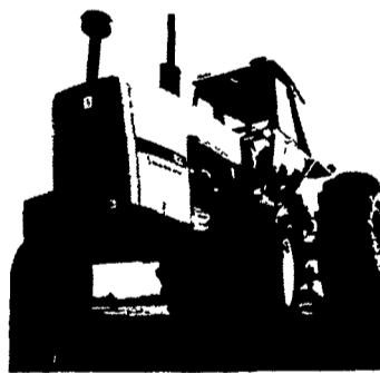
ALLIS CHALMERS 7030 TRACTOR

350 Strasburg Pike Phone 397-5179 Lancaster, Pa.