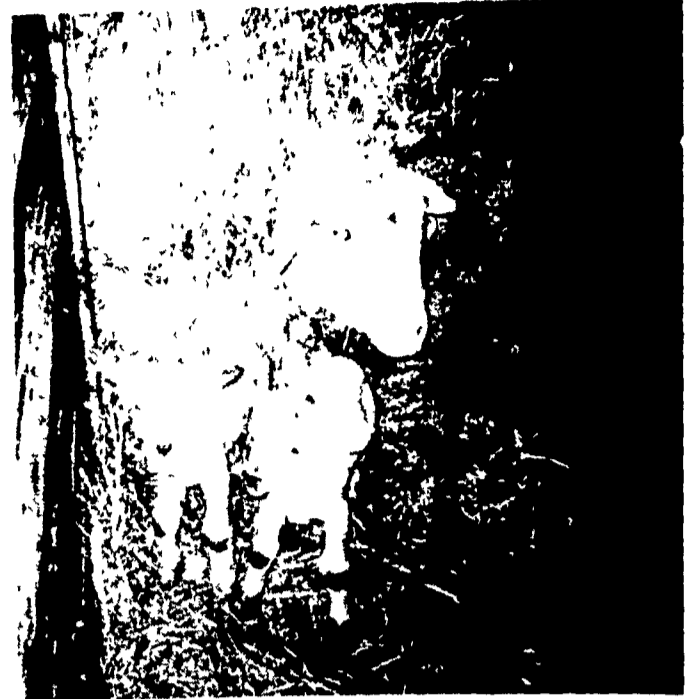
This ewe and twin lambs are one of many sets at Longenecker's.