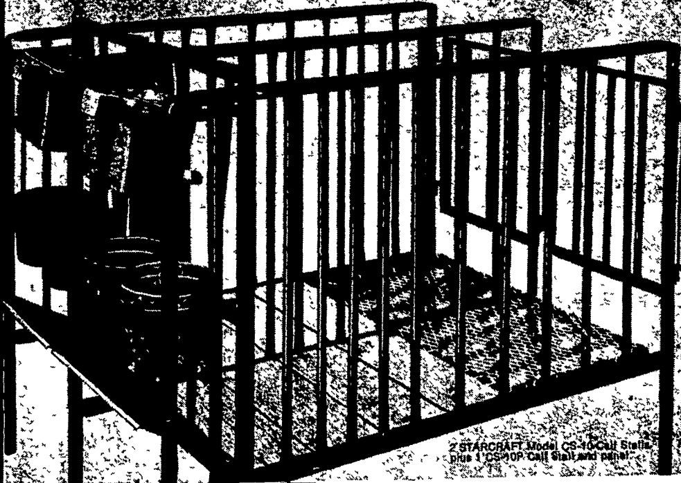
2 STARCRAFT Model CS-10 Calf Stalls Plus 1 CS-10P Calf Stall and panel.

It's built to outlast and outperform any other stall . . . at a cost that's easy to live with!