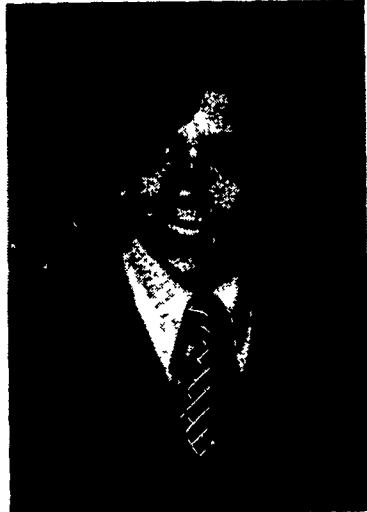
Paul E. Horning Cloister Chapter