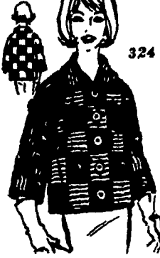
Knitted Jacket The handknit look continues to be popular this season. The attractive jacket shown may be knitted in small, medium and large sizes. Pattern No. 324 gives the instructions.