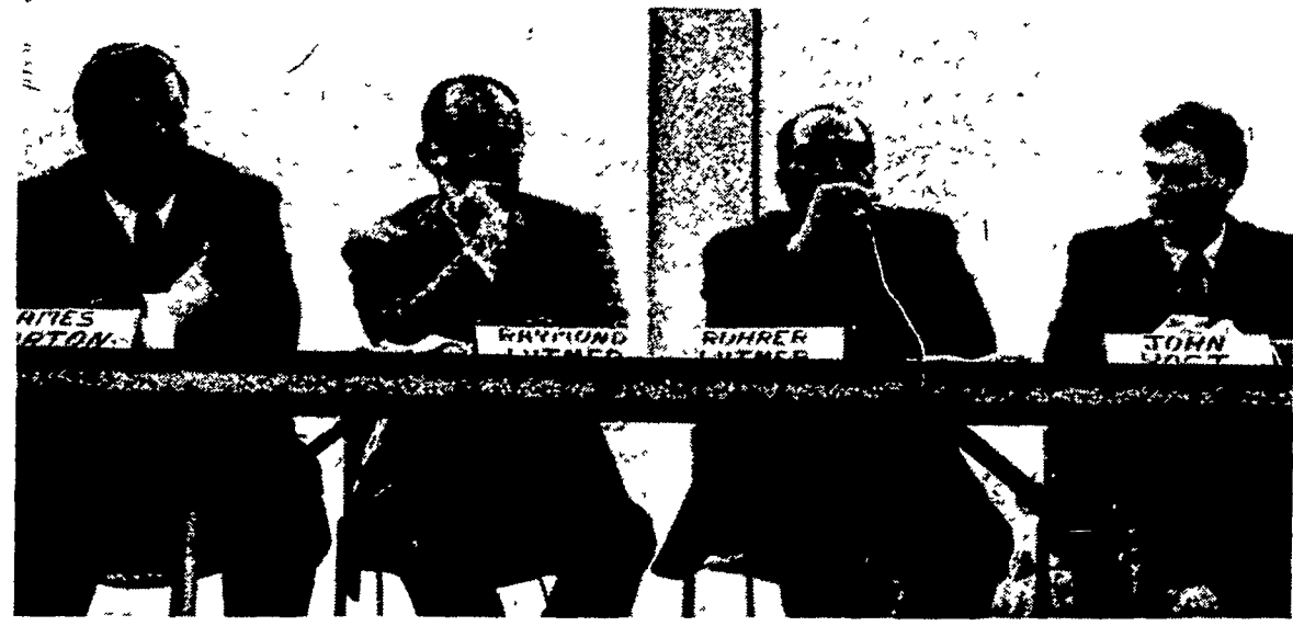
Herd management for high production was the theme for a panel discussion held March 6 during Lancaster County Dairy Day at the Farm and Home Center. Panel