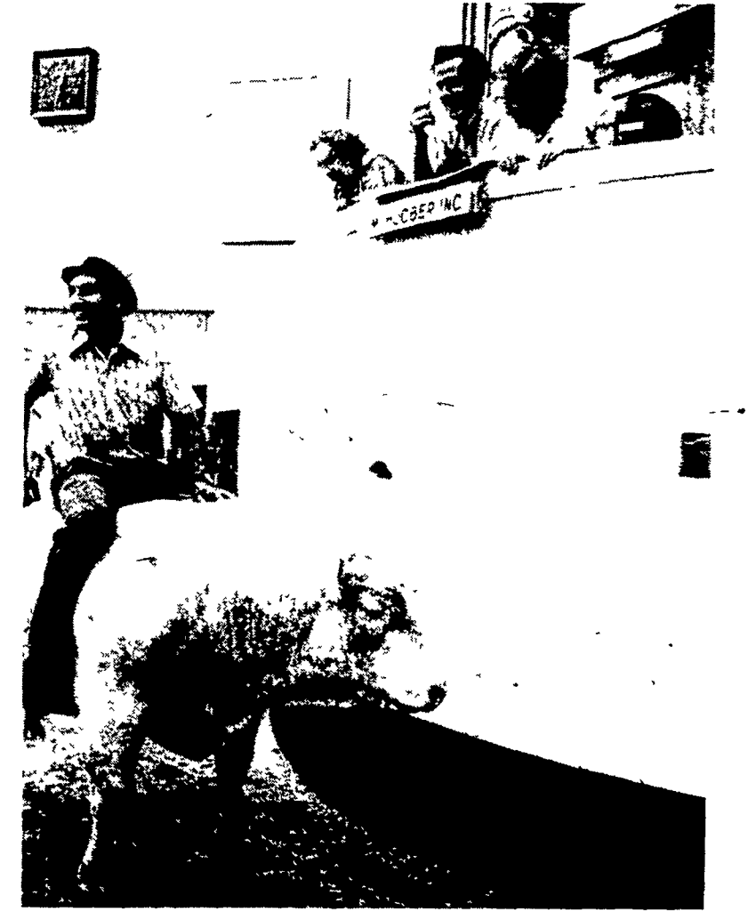
A lot of strange things happened this year at the Lancaster Stock Yards, and not the least of those strange happenings was this sight of a man riding a Charolais bull into the sale ring.