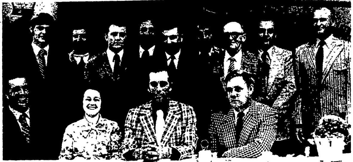
All thirteen directors of the Lancaster County Farmers Association were on hand for the group's annual meeting on October 15.