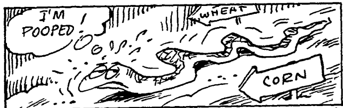
Some snake in the grass seems to have convinced the ancient Greeks that if their pet serpents moved sluggishly, they would have a poor harvest that year!