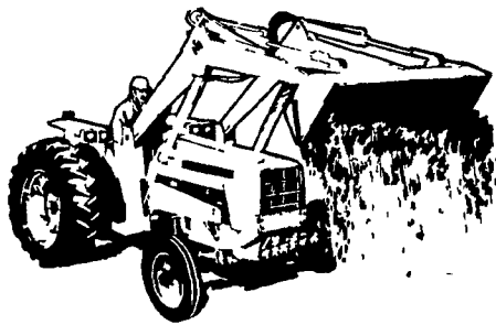
574 Tractor & 2050 A Loader