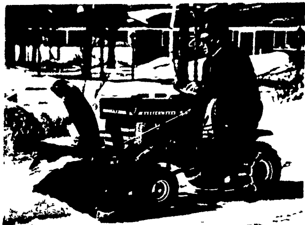
MF7 Tractor 7 H.P.