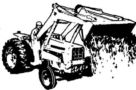
574 Tractor & 2050 A Loader