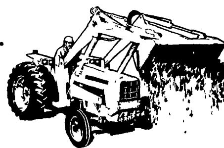
574 Tractor &amp; 2050 A Loader