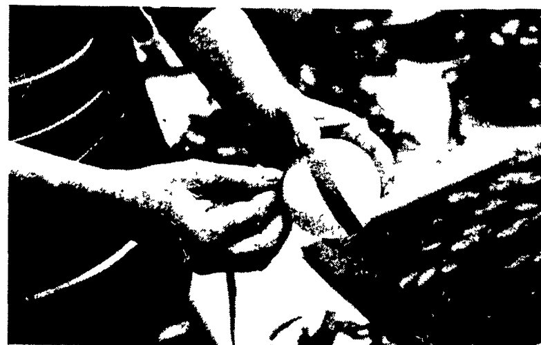
Mrs. Myers shows her cone basket filled with holly and decorated with red birds, ready to greet visitors at her door.

You need two pieces of hardware cloth - one to be used for the backing, and one which will be bowed to form the basket. The size and shape of these can be