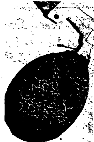
For an unusual gift you can make a tennis racket cover easily and inexpensively from hand towels.

If you're looking for something different in the way of a door hanging, why not try a basket of cones? It's easy to make and will certainly be a conversation piece. All you need is some hardware cloth, some fabric for backing, a lot of cones, some ribbon, greens and other decorations.