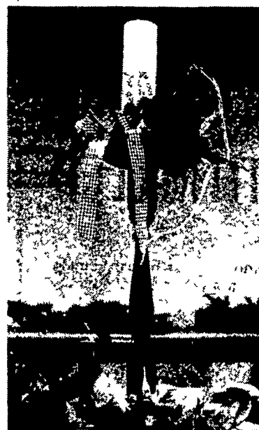
A candle on a tall stand is made special by adding a few sprigs of greenery and two clusters of "apples."

You need two pieces of hardware cloth - one to be used for the backing, and one which will be bowed to form the basket. The size and shape of these can be