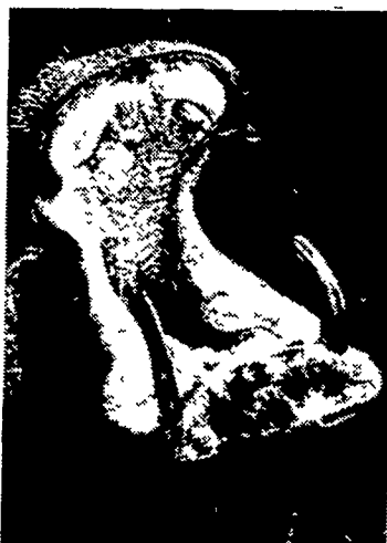
HO HUM . . . Oh what a lazy day, seems to be the sentiments of this hippopotamus. The Cleveland Zoo hippo is really begging for food.

When Power Fails depend on PINCOR Electric Plants