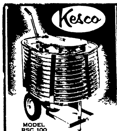
MODEL RSC 100