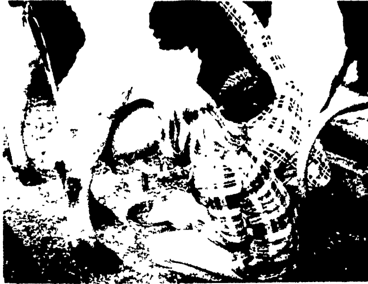
An enthusiastic student learns how to milk a cow during Farm-City exchange in the New Holland area.

Victor F. Weaver poultry processing plant. The tour consisted of following the operation from the time the chickens arrived to the time they were processed and ready to be shipped to stores.