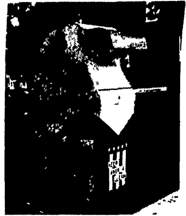
KEEPING AN EAGLE EYE OUT FOR TRASH . . . That's what the new design of trash cans encourage soldiers to do at Fort Monroe, Va.

Under the scholarship plan, the United Farm Agency will provide $1,500 annually for up to three $500 scholarships. Winners will be named by the Scholarship Committee of the College of Agriculture. Recipients will be selected from seniors majoring in animal science-veterinary medicine.