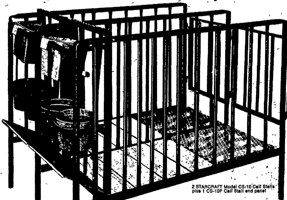
2 STARCRAFT Model CS-10 Calf Stalls plus 1 CS-10P Calf Stall end panel

It's built to outlast and outperform any other stall... at a cost that's easy to live with!