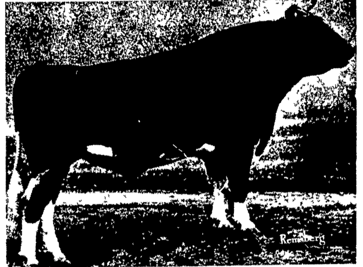
9H377 VIGO CHARMCROSS EX-93

CHARMCROSS now EX-93 is siring more milk production with higher test (3.85% Avg.) from tall, stretchy cows.