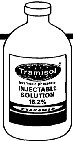
Takes the guesswork out of worming