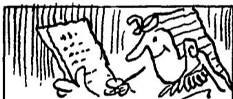
The Egyptians wrote algebraic equations in hieroglyphics about 3700 years ago.

The new packages were displayed by DRINC at the September 17-18 meeting of United Dairy Industry Association at the Hyatt Regency O'Hare in Chicago.