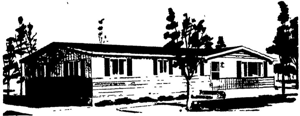
Gable optional at extra cost