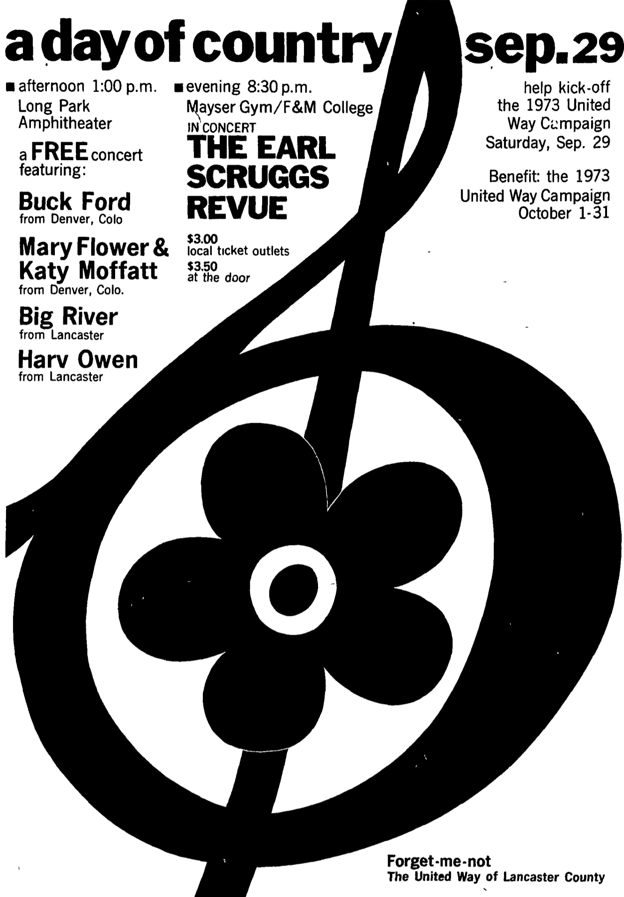
Forget-me-not The United Way of Lancaster County

Benefit: the 1973 United Way Campaign October 1-31