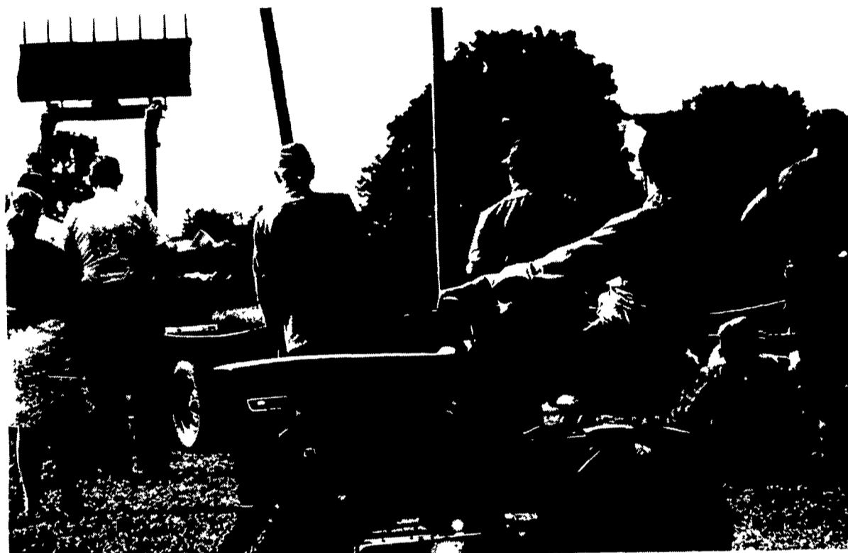
Quarryville's own version of a mounted police force took a pause from his peace-keeping duties to view the tractor driving

competition with a more-or-less professional eye.