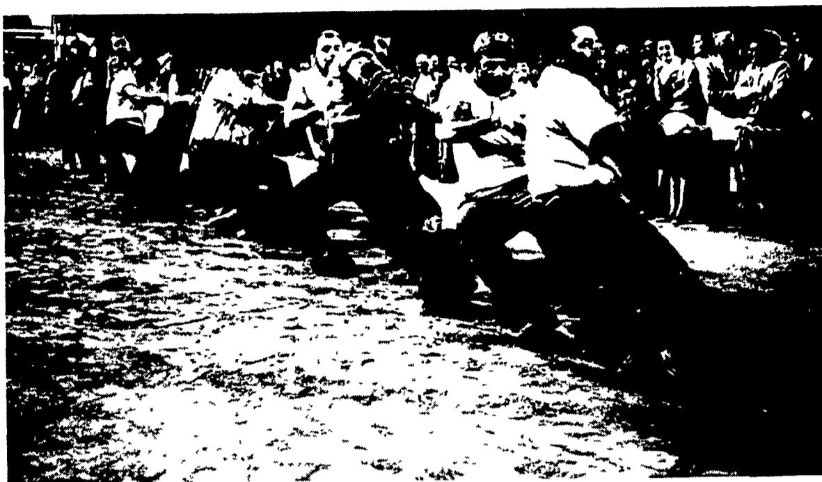
The Solanco Fair Gang are shown pulling their way to a victory over the Buck Boys in

Results of the swine competition held Thursday night were: