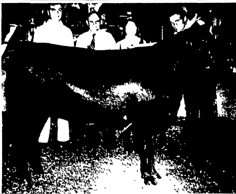
Pennsylvania State University entered the summer and reserve grand champion Angus female at the 1973 Ohio State Fair, Columbus. The winning heifer was Twin Oaks Princess.