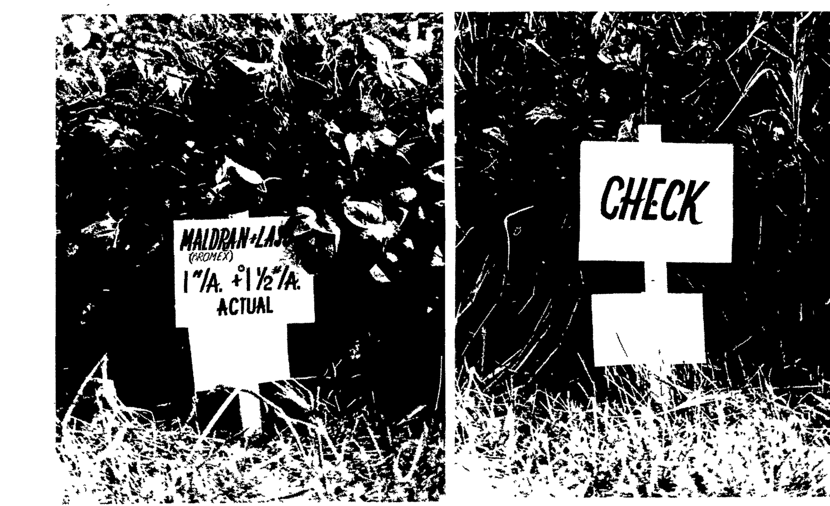
side-by-side Ag Progress Days demonstration of

Early this spring, plots were carefully marked off at the Ag Progress Days site and planted to a huge variety of crops. Plant scientists from Penn State even planted a weed plot to give visitors a first hand look at crop menaces. The weed garden, in fact, was a much-discussed feature of the threeday show, not for its flourishing crop of weeds, but for its barrenness.