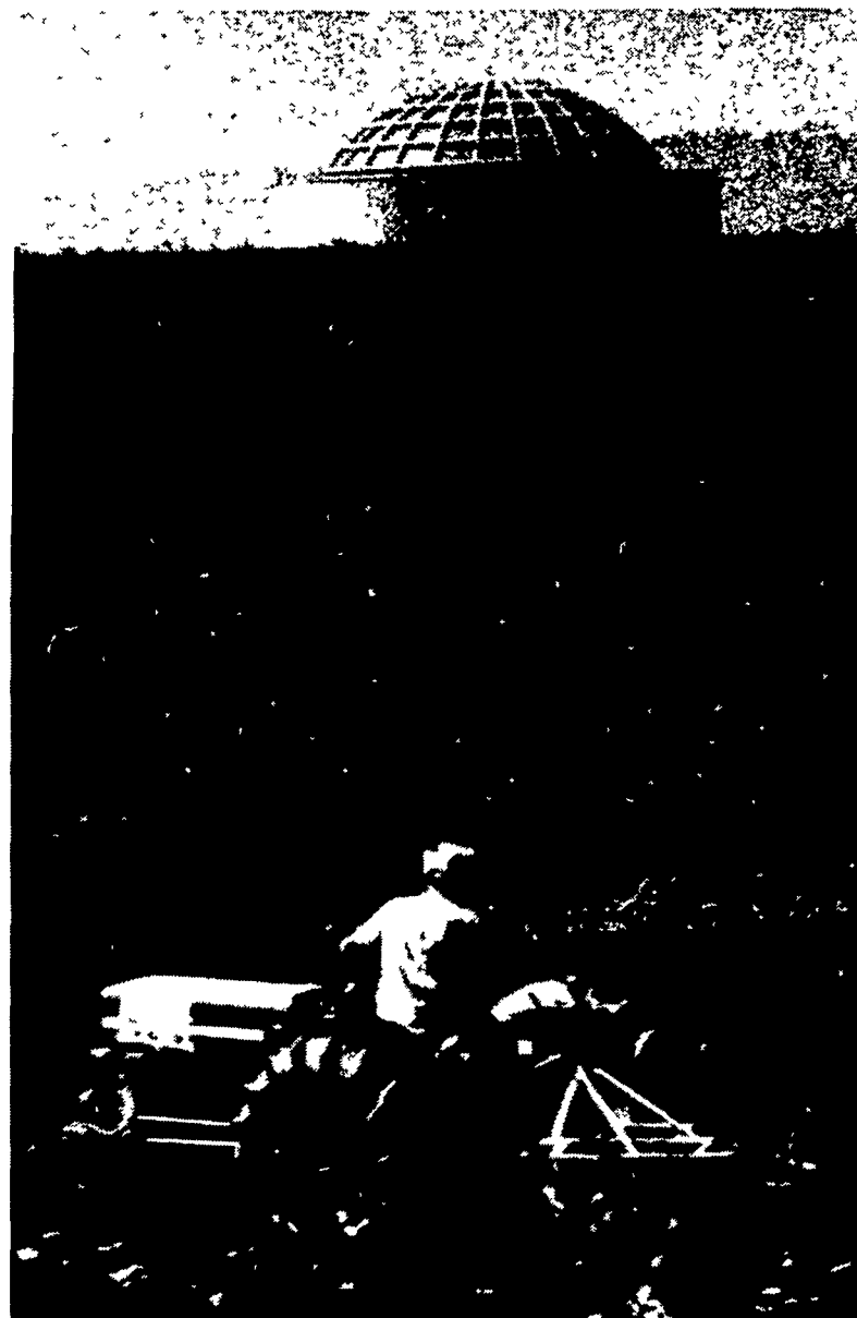
In the shadow of Founders Hall, a plowman competes in the small plow division of the State Plowing Contest last Tuesday at Hershey.