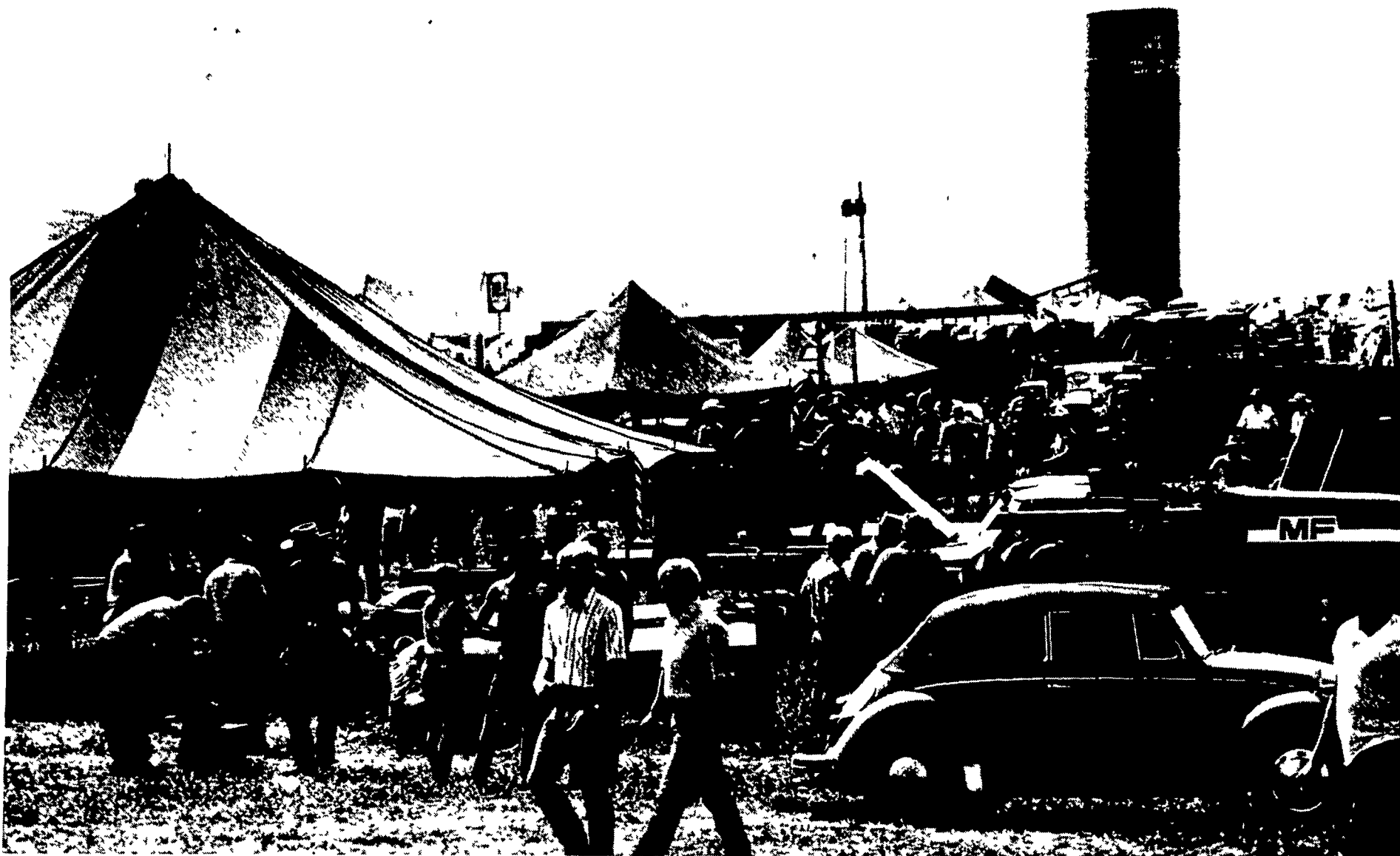
A crowd of some 40,000 people attended the three-day Ag Progress Days in Hershey this past Tuesday, Wednesday and Thursday. They braved searing

heat to watch field demonstrations, plowing contests and to visit the 120 commercial exhibits.