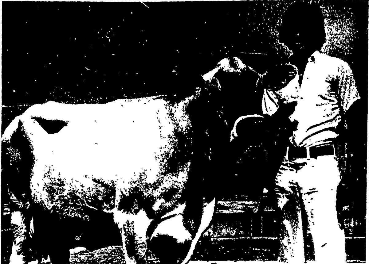
Donald Wenger, Manheim RD2, won grand champion Brown Swiss honors with this cow at the Southeastern Regional FFA

Hog and cattle prices on local markets continued the downward trend begun last week. With steers and hogs hovering around the $55.00 mark, prices were anything but low, but they were down somewhat from the inflated highs of three or four weeks ago. No one at this point has predicted a big drop from present levels. Looks like the market may have settled down for awhile.