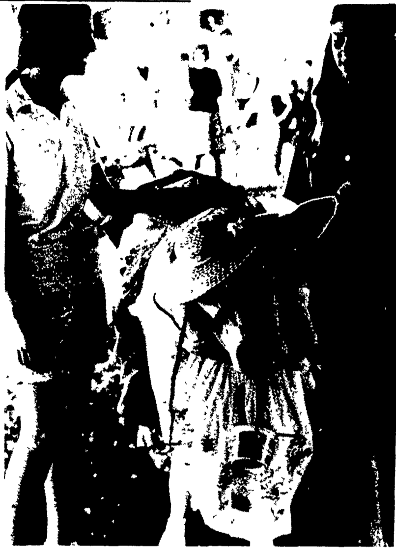
One feature of the Lancaster County 4-H Dairy Show held this week at the Guernsey Sales Barn was a dress-up revue for calves.