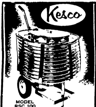
MODEL RSC 100