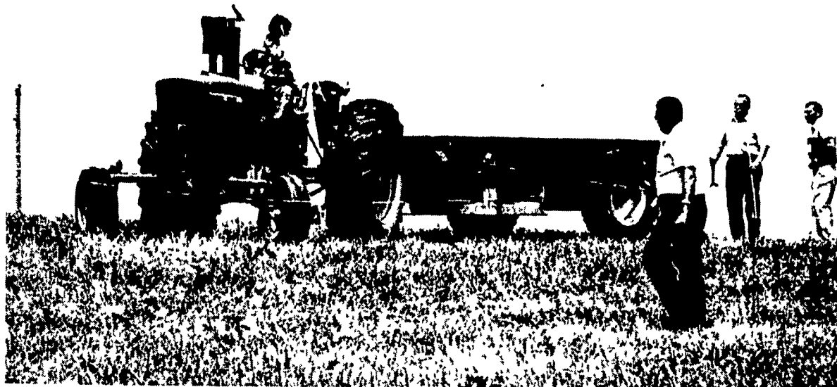
Tractor drivers tested their skills Tuesday during the Lancaster County Conservation Field Days. This driver is trying to

maneuver a manure spreader into a small area enclosed by ropes.