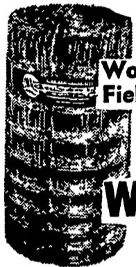
Woven Wire Field Fence