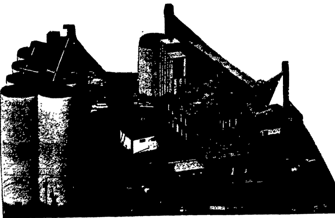
Grain Elevator, Feed Warehouse & Flour Mill, Fleetwood, Pa.

Modern Mechanized Facilities To Serve You Faster. . .