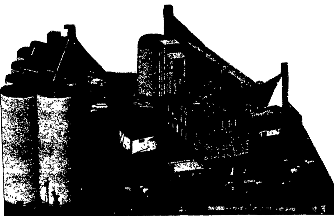
Grain Elevator, Feed Warehouse & Flour Mill, Fleetwood, Pa.