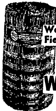
Woven Wire Field Fence