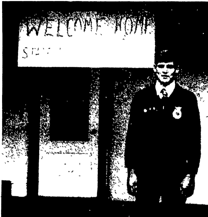
There was a big "Welcome Home" sign awaiting the newly elected State FFA treasurer when he arrived home last week.