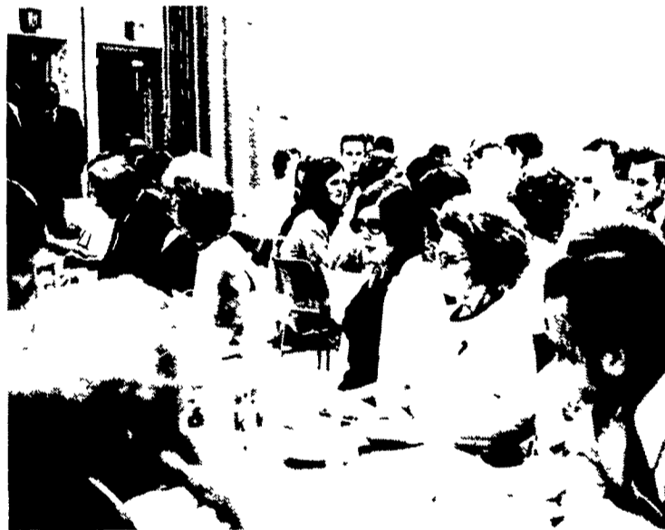
The crowd was well-fed and expectant as they awaited the decision of the judges at the Farm and Home Center Saturday night.