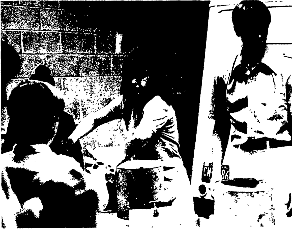
The dairy booth at the Lebanon County Dairy Princess Festival does a booming business. Offered were free milk, 10 cent double-dipper ice cream cones and 25 cent do-it-yourself sundaes.