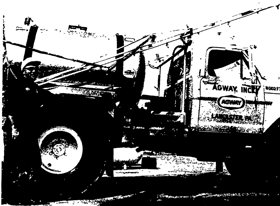
AGWAYS LOCAL DRIVER-TRAINER, VERNON FRANKHOUSER

Certainly with Lasso ® plus atrazine tank mix on corn this year you can plant soybeans next year.