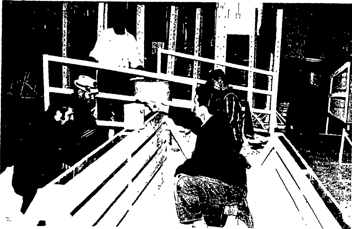
Members of Warwick Township Lions Club paint jump equipment in preparation for the club's 16th Annual Horse Show, scheduled for all day Sunday at Forney's Polo Field, Rothsville. Left to right, they are