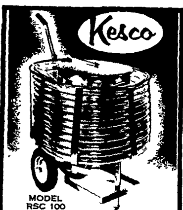
MODEL RSC 100

P S — If you're not sure you told us already, we don't mind hearing from you again.