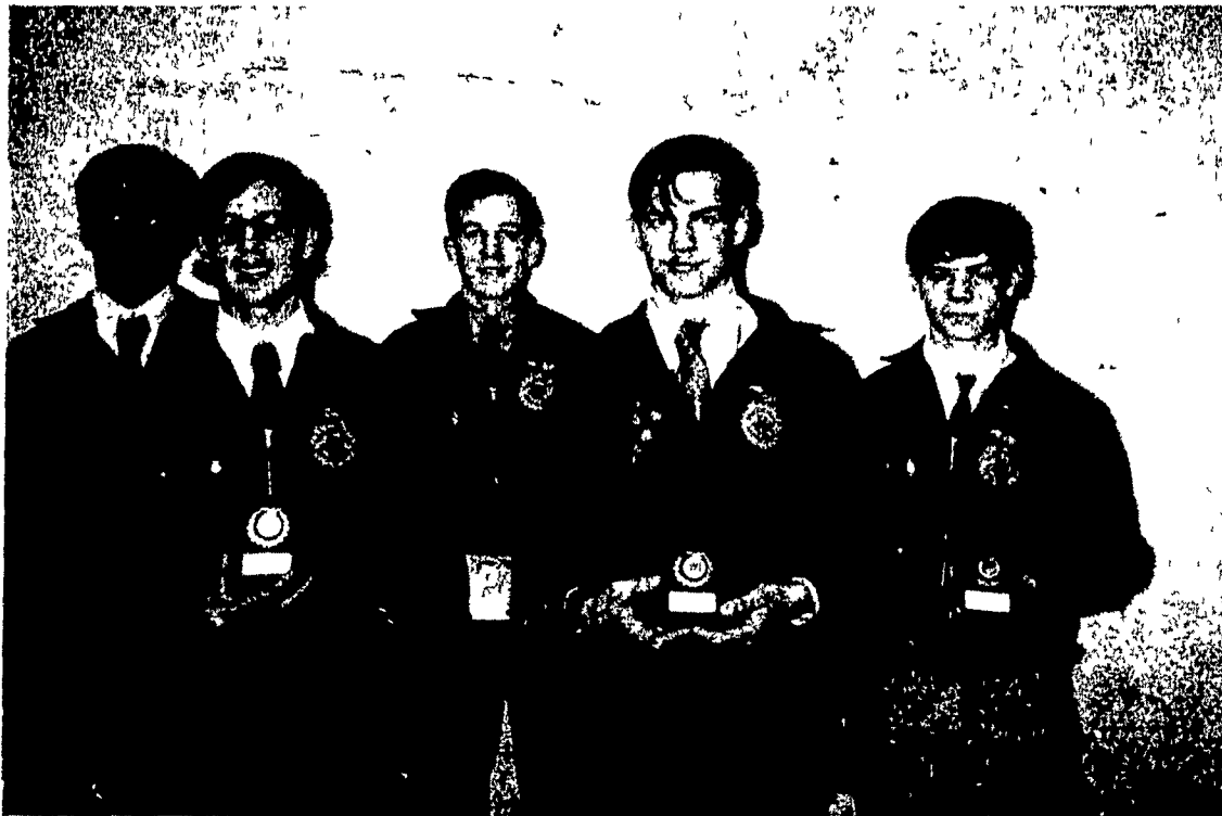
Recognized for being high salesmen in the orange sale at Pequea Valley were, (left