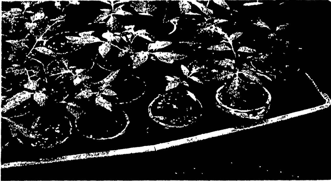
These tomato plants have just been put in individual pots. Greenhouse tomatoes have a head start in early April.