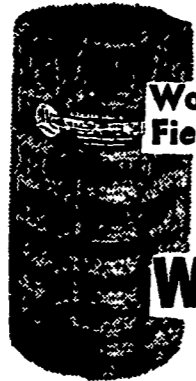
Woven Wire Field Fence