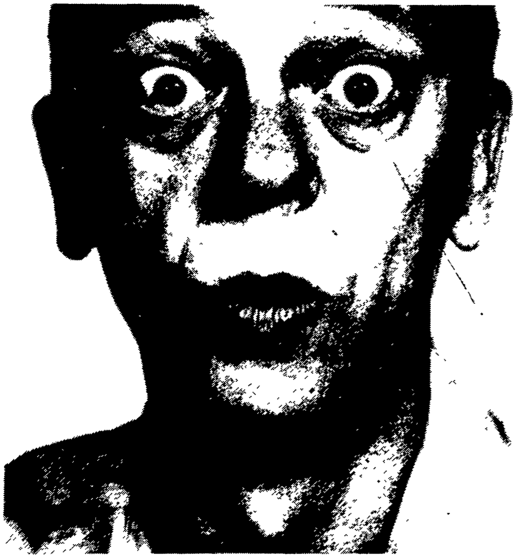
Mr. Don Knotts

An International Paper Company pine plantation is a part of the company's "Dynamic Forest." Each acre of trees contributes enough oxygen each year to supply the needs of 18 people. Thus it is estimated the company's one million acres of planted pine trees in the South supply the life-giving oxygen needs of 18 million people annually.